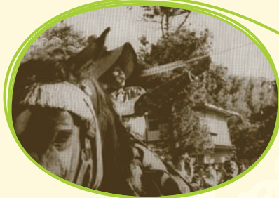
Autumn festival at Sasaba Shrine (In Hatamiya)

“Speaking of which, I recall that my grandmother made dried persimmons like this.”